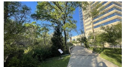
The Galatyn Woodland Preserve