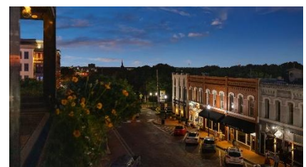
The CORE District